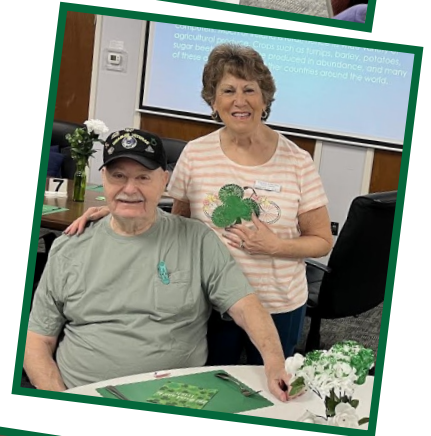
Bottom Row: Participants at the Luncheon.